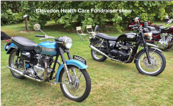
Clevedon Health Care Fundraiser show