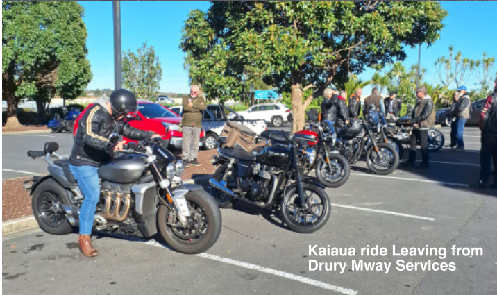
Kaiaua ride Leaving from Drury Mway Services