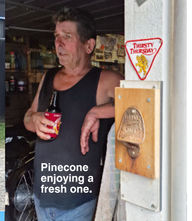
Pinecone enjoying a fresh one.