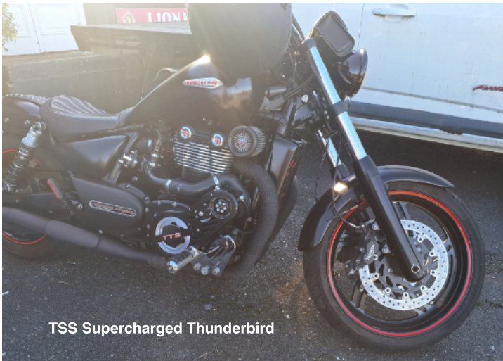
TSS Supercharged Thunderbird