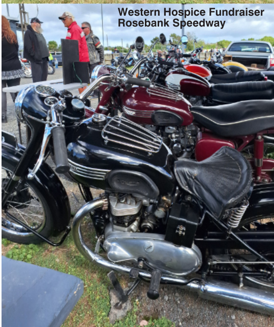
Western Hospice Fundraiser Rosebank Speedway