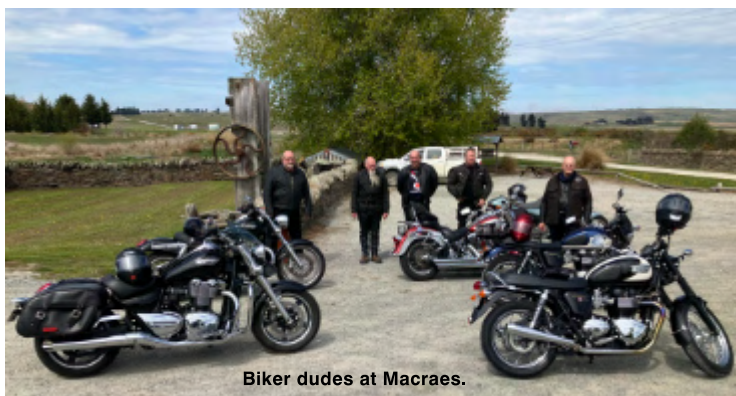
Biker dudes at Macraes.