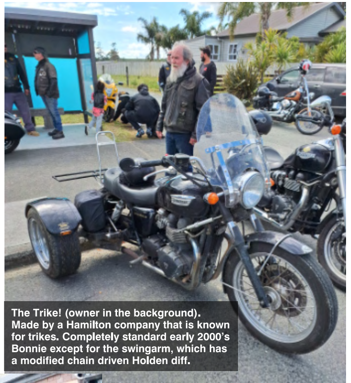
The Trike! (owner in the background). Made by a Hamilton company that is known for trikes. Completely standard early 2000's Bonnie except for the swingarm, which has a modified chain driven Holden diff.