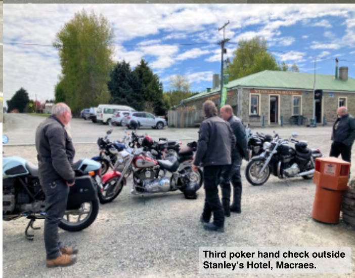
Third poker hand check outside Stanley's Hotel, Macraes.