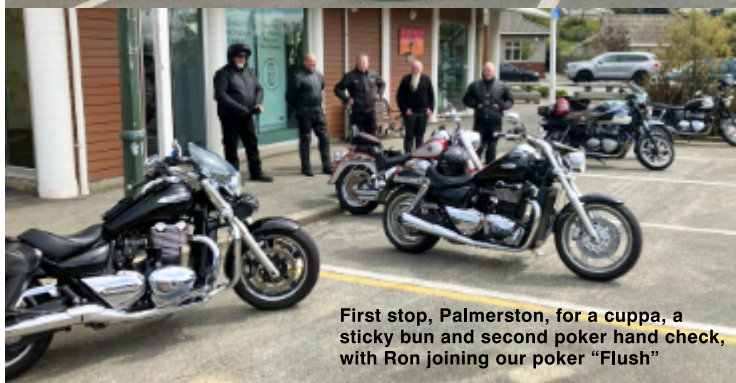
First stop, Palmerston, for a cuppa, a sticky bun and second poker hand check, with Ron joining our poker "Flush"

With five local members leaving Dunedin, Otago Southland Chapter's National Poker Run participation was a very enjoyable day's ride over what is locally known as "the Loop". After having checked the first Poker hands we had received by text, we took this scenic route (with some excellent riding roads) departing Dunedin heading north.