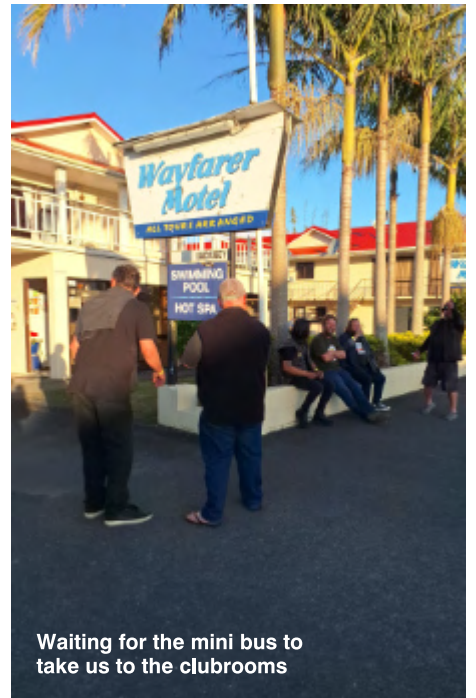
Waiting for the mini bus to take us to the clubrooms

Next day, Awanui held its market day, along with the Northland Riders "To The Top" poker run (fantastic community event). Taking part in the poker run, you can do