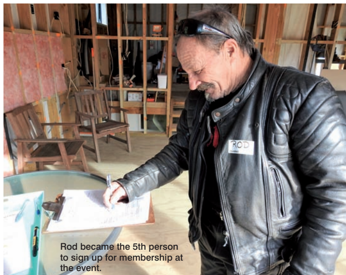
Rod became the 5th person to sign up for membership at the event.