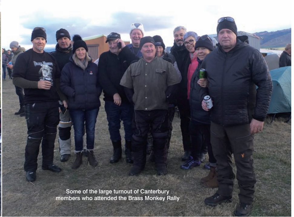
Some of the large turnout of Canterbury members who attended the Brass Monkey Rally