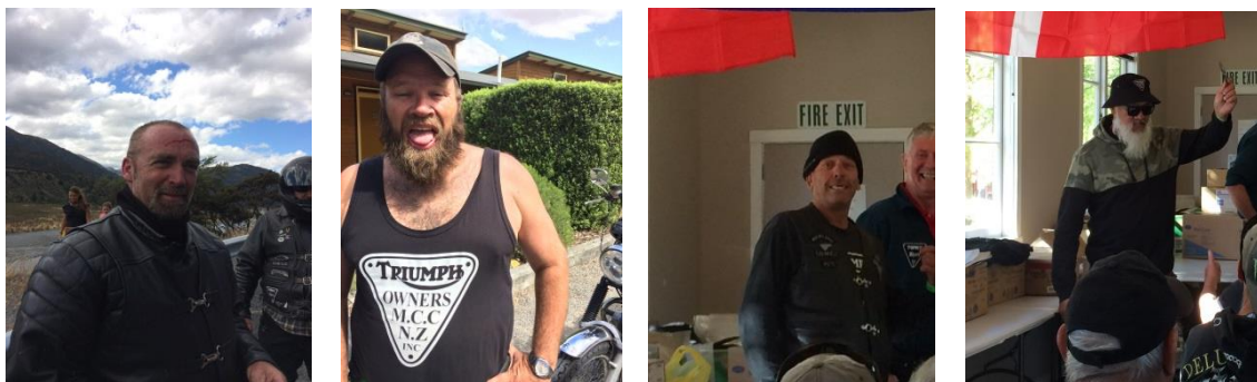
Some happy Auckland members at this year rally

Attached file with email is next year national rally poster and entry form, as a bit of encouragement to get you along the Auckland area will have a draw for one member to win back there rally entry, so get your entries in before cut off of 20 th December and we will do the draw at the January club meeting.